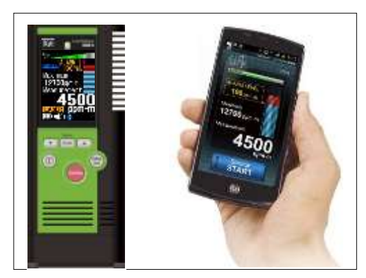
Fig. 3: Laser Methane Detector with GasViewer App on a smartphone (Crowcon Detection Instruments Ltd., Abingdon, UK)