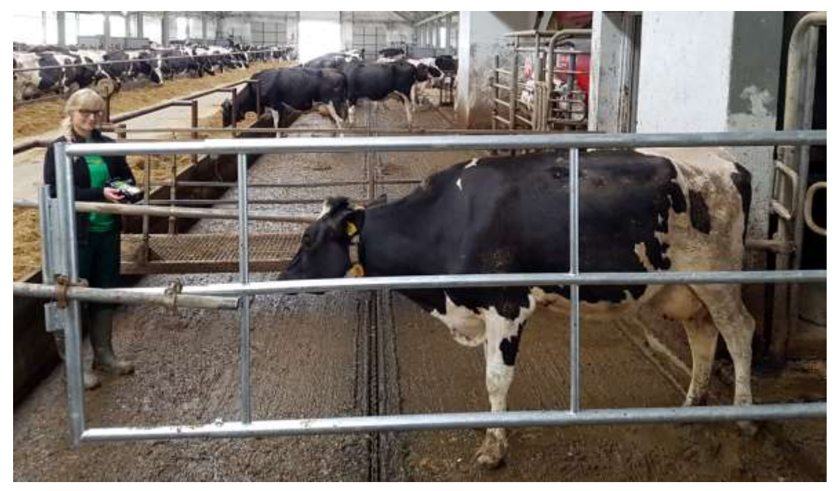
Fig. 2: Measurement of a cow with the Laser Methane Detector after leaving the automatic milking system

A gate and a bar was installed behind the exit of the AMS, such that a small pen was constructed. Cows leaving the AMS were restrained there for the LMD measurement (figure 1). With this setup, the LMD profiles could be taken immediately after the FTIR measurement. The LMD measurements were taken at 1 m distance from the cow's mouth, so that the values recorded in ppm-m by the LMD could be transformed to ppm by dividing by 1 m (figure 2). The LMD (figure 3) is a portable, hand-held device which specifically measures the column density of methane in air without contact to the source by infrared spectroscopy. The wavelength of the laser is specifically set to the absorption of methane. The data are sent via Bluetooth connection to a smartphone running the GasViewer app. The app stores the data in a .csv file on the phone from where they can be transferred to a computer.