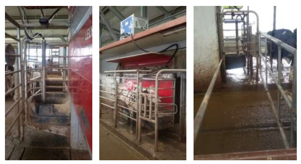
Fig. 1: FTIR methane measurement in the automatic milking system (AMS) (left and centre), pen to hold a cow during the LMD measurement after leaving the AMS (right)

FTIR measurements were carried out during milking in the AMS. Air exhaled by the cow while she was eating the concentrate dispensed in the feed bin was sampled (figure 1). The analyser unit located on top of the milking shed (figure 1) was continuously recording the methane profiles of the exhaled air during the entire milking procedure and stored them in the database as the average concentration from 5 seconds periods.