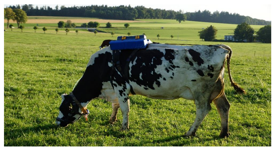
Fig.1: Equipment of the SF<sub>6</sub> tracer technique on a grazing cow