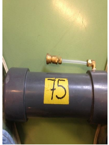
Fig. 2: Evacuated canister

80 breath samples of the experimental cows, containing respired and eructed gas, were stored under overpressure and were analysed using a GC (Varian Chrompack, CP-9003). A canister and the GC were connected by means of a Swagelok connection (figure 2 and 3).